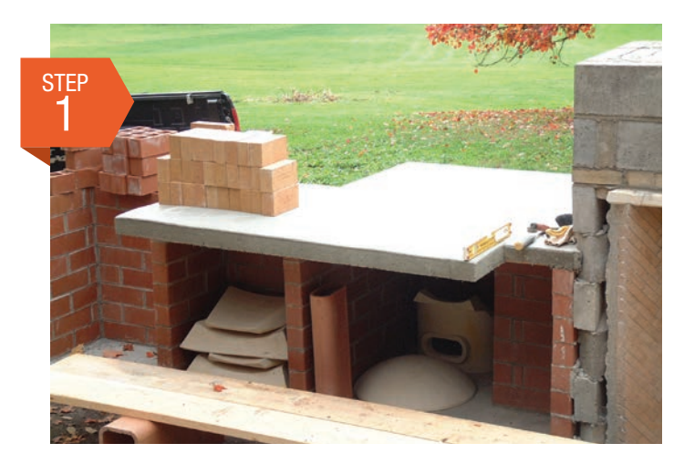
Build masonry base at least 52" wide by 64" deep, and 38" high for a finished oven floor 42" above the kitchen floor or ground.

The inside of the oven is 36" in diameter and the walls will be at least 8" thick so the rectangular or rounded base should be at least 52" wide and 64" front-to-back to allow for a 12" counter or hearth extension in front of the oven entrance.