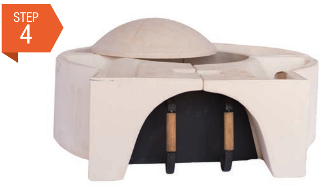
Set the oven dome on top of the base sections in HeatStop II refractory mortar.

Special note: The dome and sidewalls of the brick oven are likely to crack. Cracking of the dome is not structurally hazardous, and is necessary for natural expansion and contraction of the masonry dome, which will occur during extreme heat fluxuations.