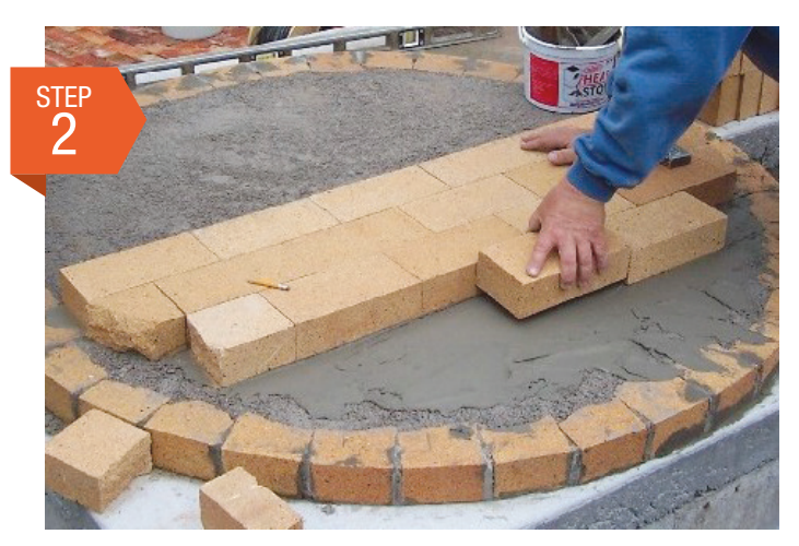
Cast a 2" thick layer of insulating refractory concrete on top of the base and set the firebrick oven floor directly on the insulating refractory concrete.

The inside of the oven is 36" in diameter and the walls will be at least 8" thick so the rectangular or rounded base should be at least 52" wide and 64" front-to-back to allow for a 12" counter or hearth extension in front of the oven entrance.