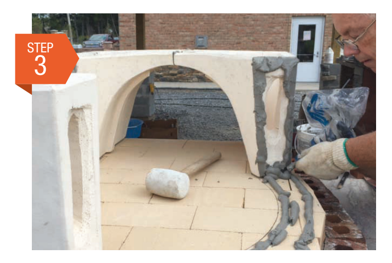
Lay out a 36" circle on oven floor and set the 2-piece entrance tunnel and two sidewalls using HeatStop II refractory mortar.