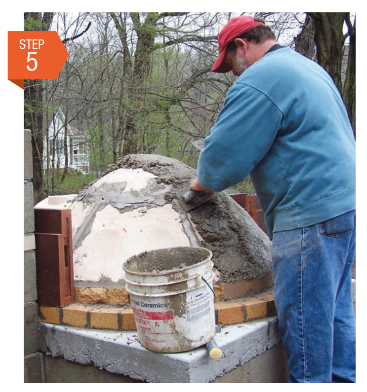
Parge the sides and top of the oven with the insulating refractory concrete at least 2" thick.