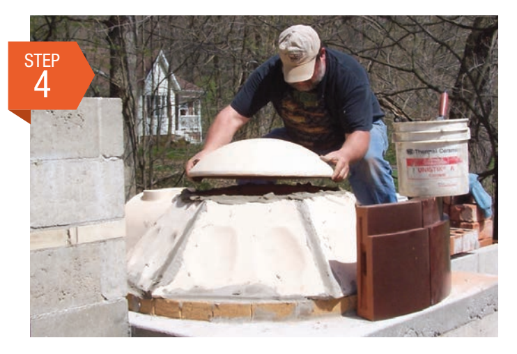
Set the oven dome on top of the base sections in HeatStop II refractory mortar.

Special note: The dome and sidewalls of the brick oven are likely to crack. Cracking of the dome is not structurally hazardous, and is necessary for natural expansion and contraction of the masonry dome, which will occur during extreme heat fluxuations.