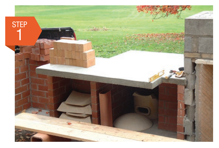
Build masonry base at least 52" wide by 64" deep, and 38" high for a finished oven floor 42" above the kitchen floor or ground.

The inside of the oven is 36" in diameter and the walls will be at least 8" thick so the rectangular or rounded base should be at least 52" wide and 64" front-to-back to allow for a 12" counter or hearth extension in front of the oven entrance.