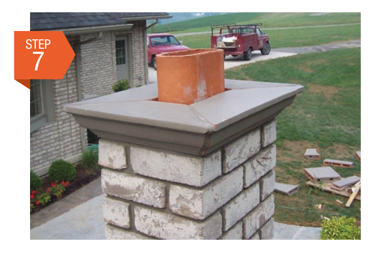
The 4" x 8" flue liner should be enclosed within a chimney with walls at least 4" thick of solid masonry. If the chimney is inside a house, it must conform to all applicable codes dealing with clearance to combustibles and height above the roof. If the oven is outside, the flue need only be enclosed in masonry as high as is desired and clear of combustibles.